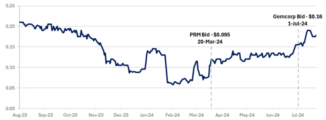
Figure 2: Historical performance of Sierra Rutile Shares